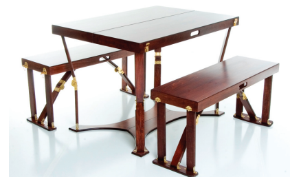
Shown above with picnic table (product #P3043)

U.S. Pat. # 6,779,466 European Pat. # 1 450 644 U.S. and Foreign Patents Pending 1 Year Warranty Manufactured in China